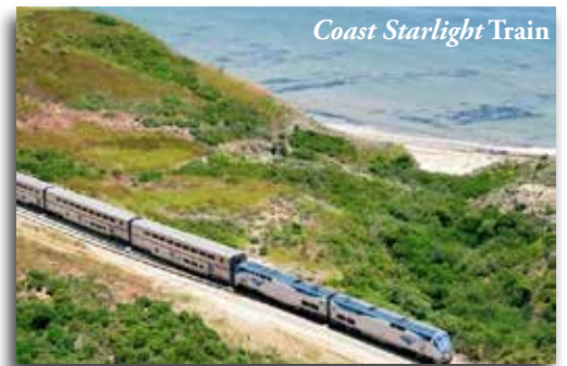
Coast Starlight Train