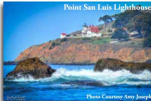
Point San Luis Lighthouse